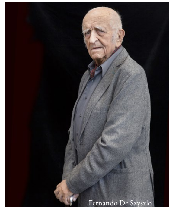
Fernando De Szyszlo