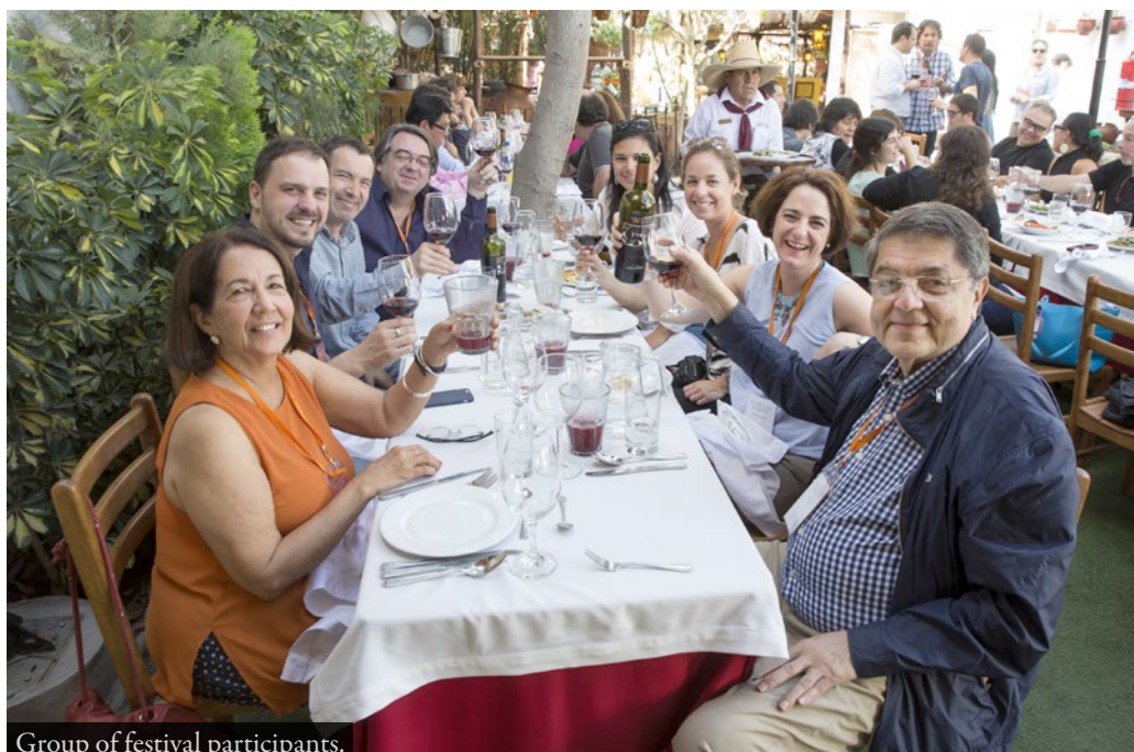
Group of festival participants.