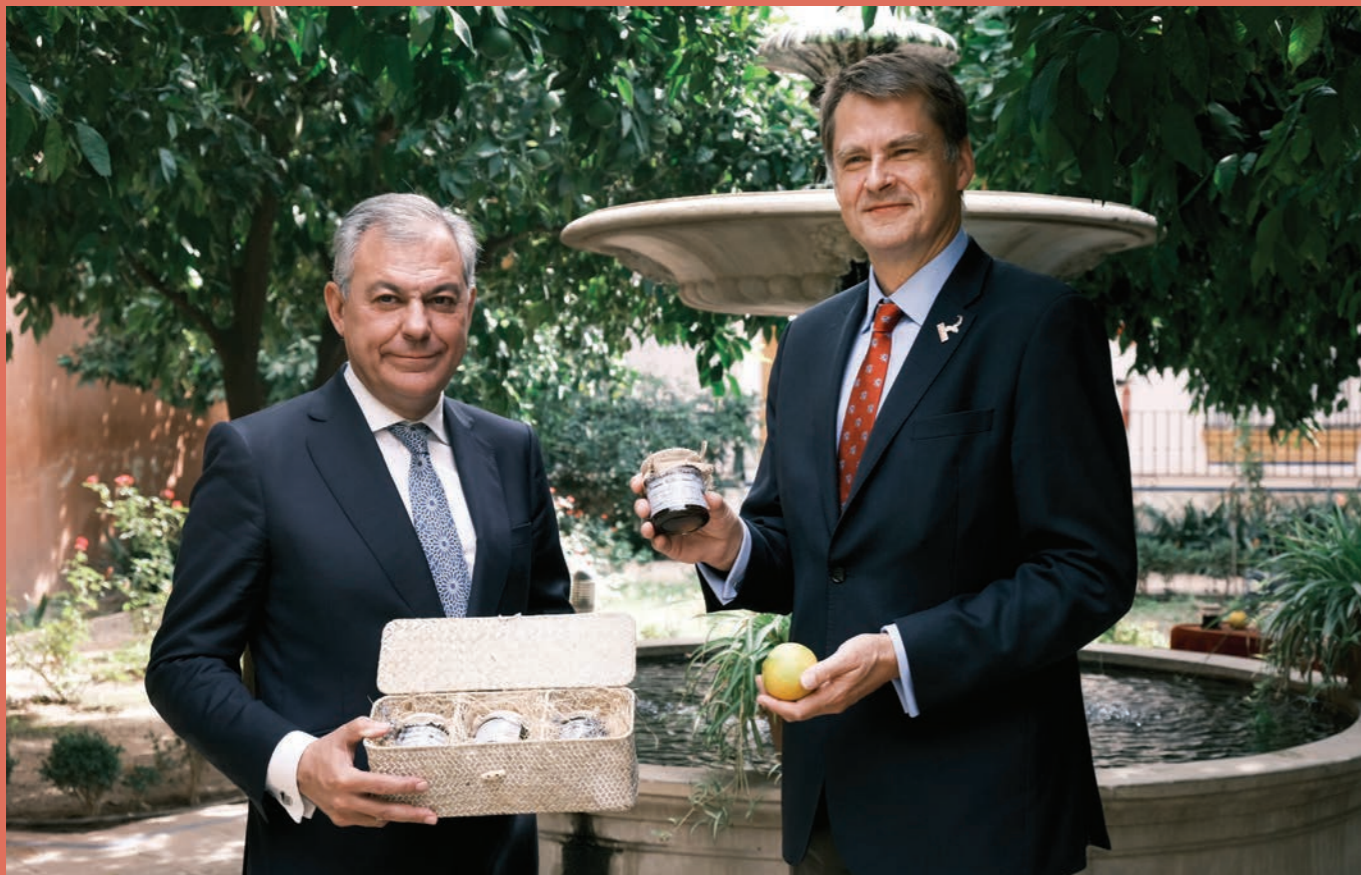
(Top) Tomás Burgos, Deputy Minister of the Presidency of Andalusia Regional Government, Maria Sheila Cremaschi, Director Hay Festival Segovia and Hay Forum Sevilla, José Luis Sanz, Mayor of Seville, Minerva Salas, Delegate of Culture of the City Council of Seville, and Víctor González, Deputy Minister of Tourism, Culture and Sport of Andalusia Regional Government