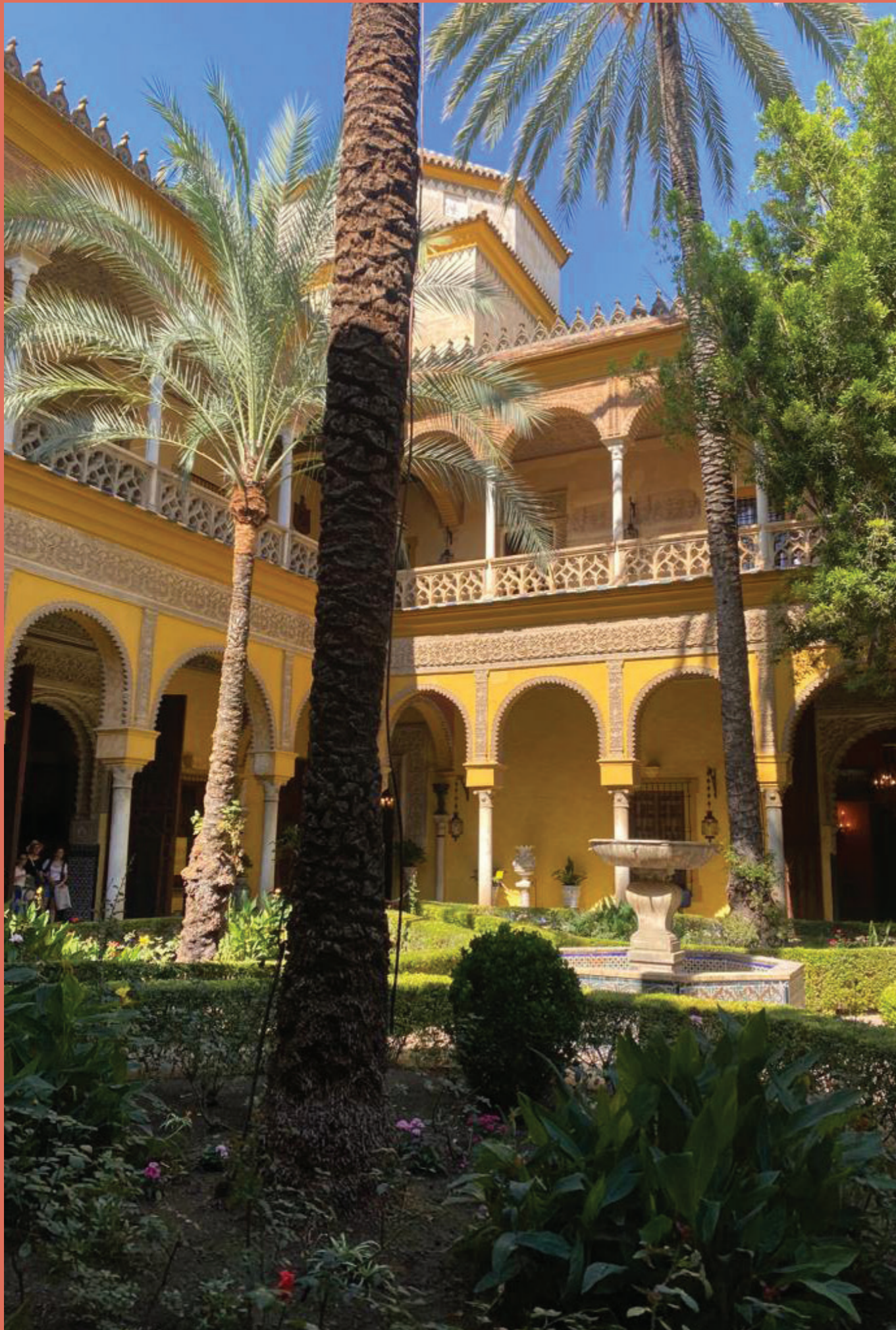
Palacio de Las Dueñas, Seville