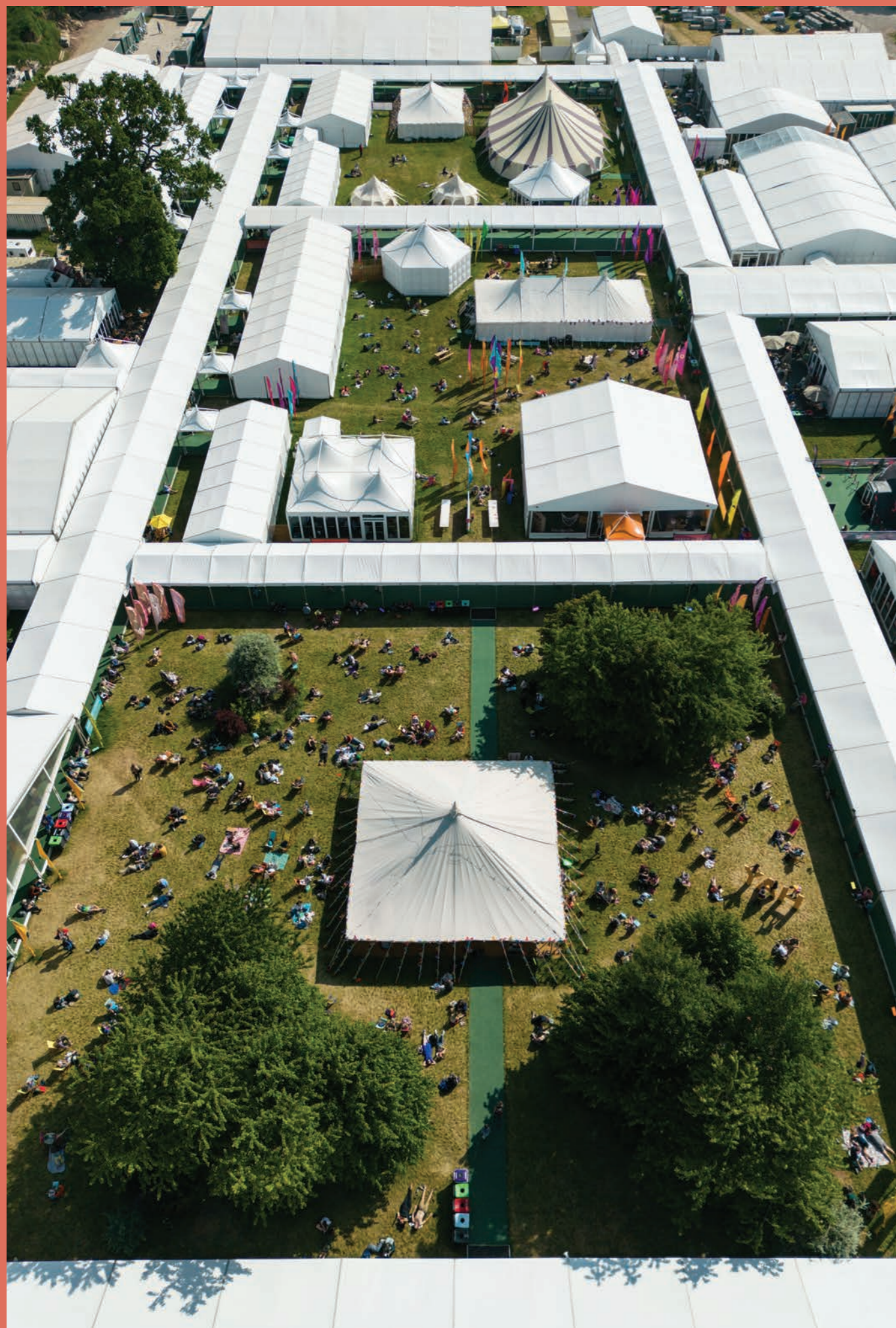
Hay Festival site in Hay-on-Wye, Wales