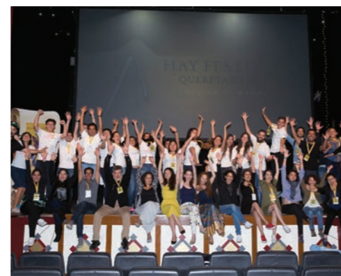
Volunteers at Querétaro 2016