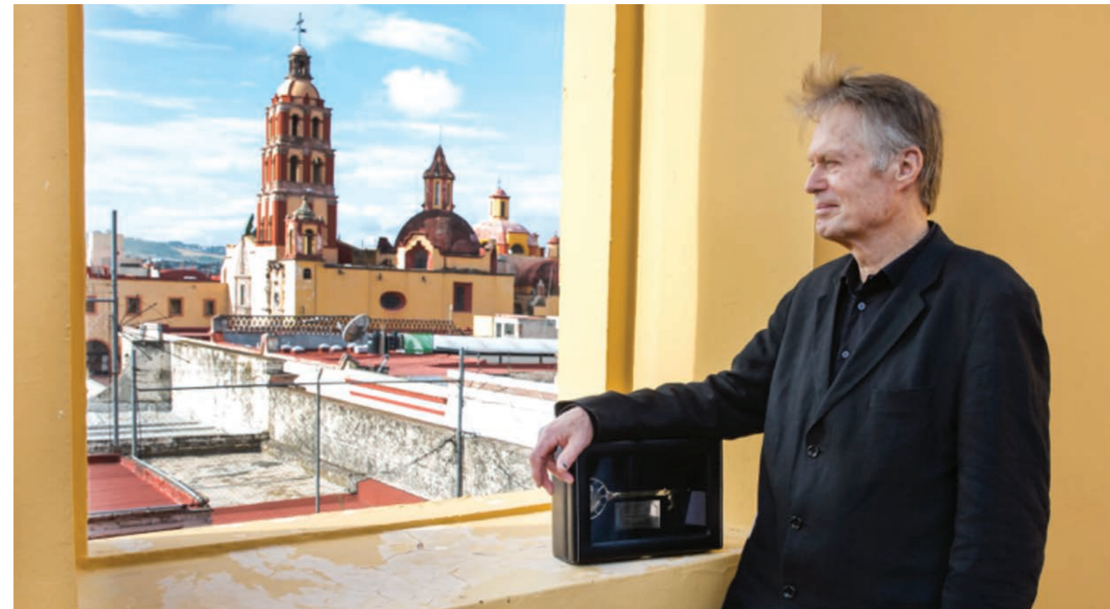
J. M. G. Le Clezio In Queretaro